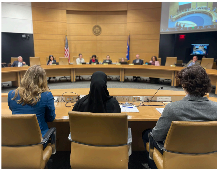
Students testifying at the Minnesota Senate Education Finance Committee during the 2024 legislative session.