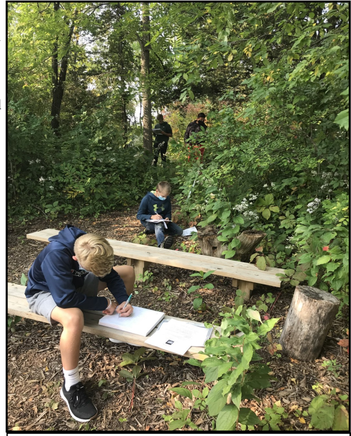
Language Arts studies in the school forest.

Before the year started, teachers and staff were trained by the naturalists from Baker Outdoor Learning Center on outdoor learning techniques. The middle school has had a partnership with Baker for many years, and it was exciting to learn from the experts about how to run an outdoor classroom. Teachers identified outdoor learning spaces, from fields and the school forest to gardens and the Crow River, and gathered outdoor learning materials such as clipboards, sit-upons, buckets, easel whiteboards, and other items to make teaching outside possible.