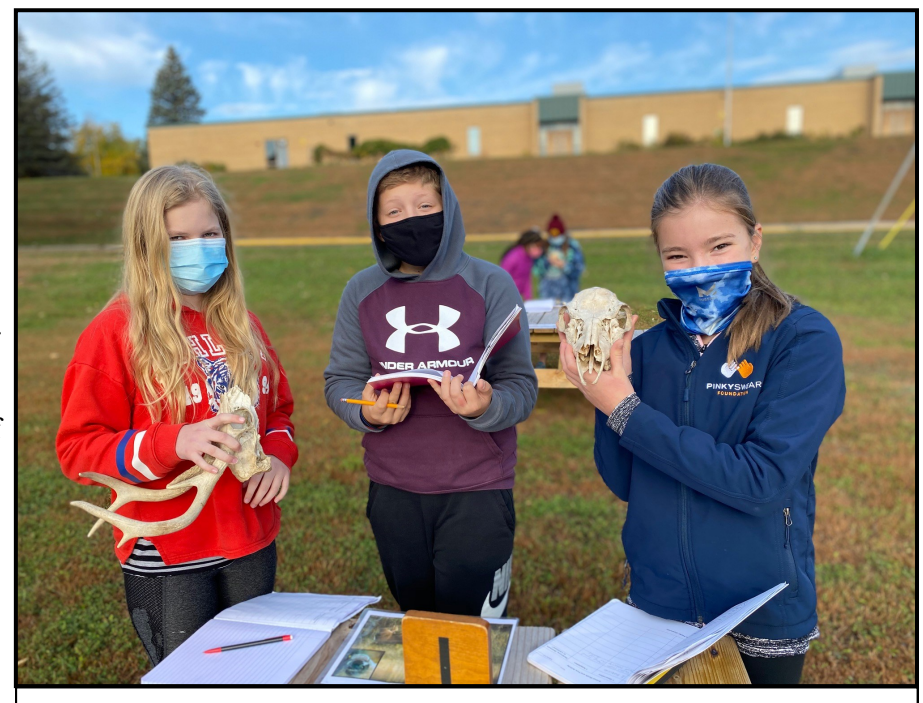
Fifth graders identifying animal skulls and pelts

RMS-CES teachers work incredibly hard to provide engaging lessons in the outdoor classrooms near our building. Students and staff both report feeling connected to nature and excited about being outside during the school day. Despite all the challenges that 2020 has brought to education, being outside with students was a continued highlight of the start of the school year.