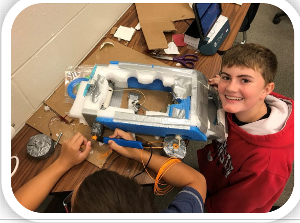
Gateway Academy students designed and built their own models of vehicles that run on alternative energy.

How can we, as engineers, develop a mode of transportation that reduces the use of fossil fuels? How can we, as a community, help victims of Hurricane Harvey? These are only a couple of the driving questions that students at Gateway Academy, a District 192 choice school, asked when they began this school year. Personalized learning is more than a catchphrase in District 192. Innovative, personalized learning is an integral part of the strategic plan that shows up throughout the district, but nowhere more so than Gateway