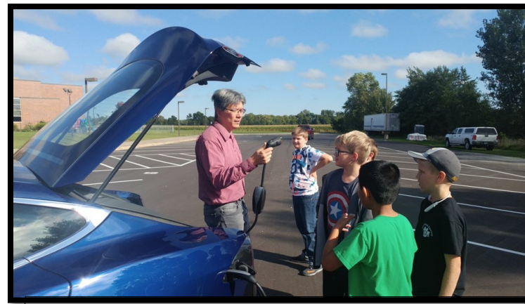
A group of local Tesla owners and enthusiasts visited Gateway Academy to teach students about alternatives to fossil fuels.

Gateway Academy regularly engages in service learning projects such as cleaning up parks, visiting care centers and conducting food drives. When Hurricane Harvey struck, the students felt an immediate and personal need to help those