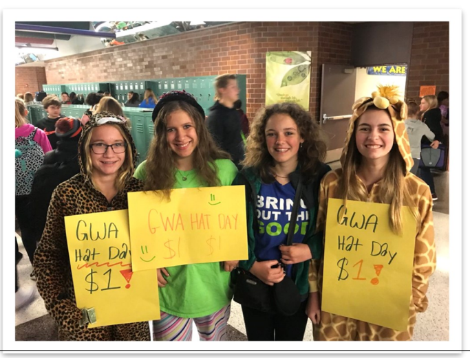
Gateway Academy students hosted a Hat Day fundraiser at Dodge Middle School to raise money for victims of Hurricane Harvey.

who had suffered from the storm. They planned and hosted several fundraising events, including selling hot chocolate, a pajama day and a hat day, to raise over $1,000 for schools, classrooms and students affected by the hurricane.