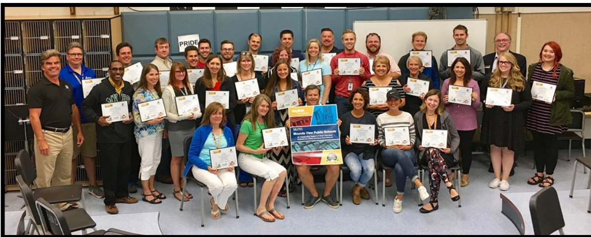
Representatives from Schmitt Music congratulated Mounds View Public Schools music teachers for maintaining their commitment to music and earning the Best Communities for Music Education distinction.