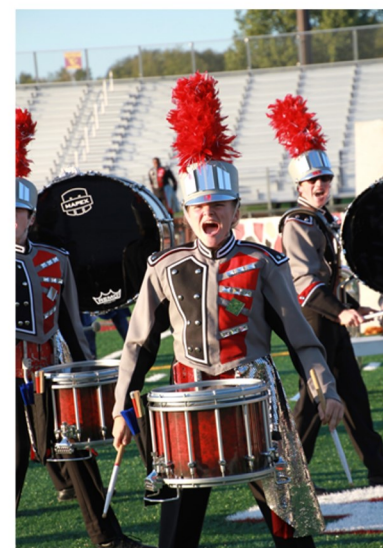
Nearly 87 percent of District high school students participate in at least one club, sport or musical opportunity. Irondale High School's award-winning Marching Band is made up of 90 students.

Not only have these donations helped outfit the program with necessary brass, woodwinds and string instruments, they have also helped the District to free up resources for larger music program initiatives.