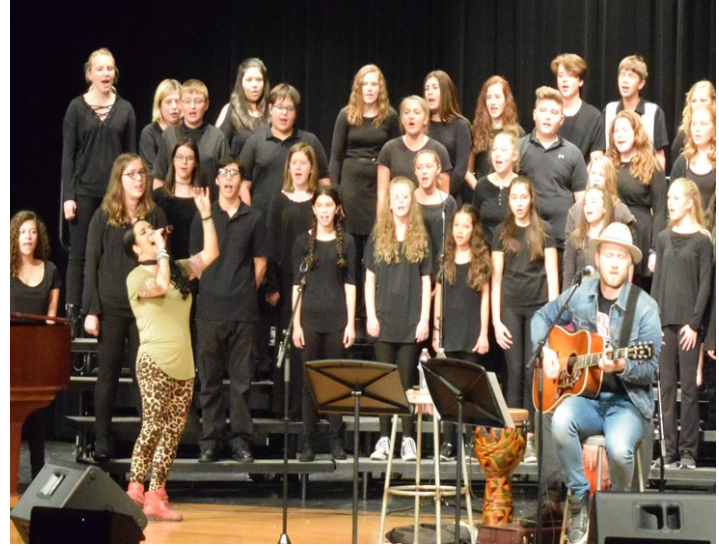
In November, District choir students performed with nationally-recognized singer and songwriter Kat Perkins at Mounds View High School for the first 2017 concert in the District's annual Music at Mounds View series. Orchestra students will perform with musicians from a professional instrumental trio, Clocks and Clouds, in January.