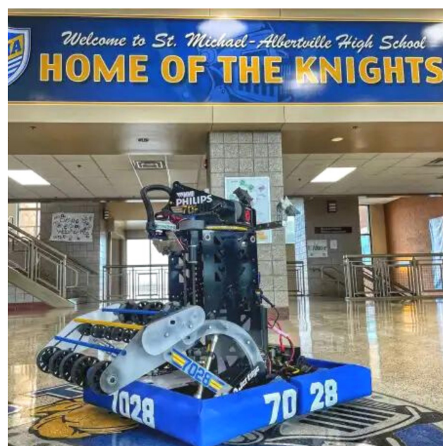
STMA's Binary Battalion's 2022 Competition Robot, Onyx