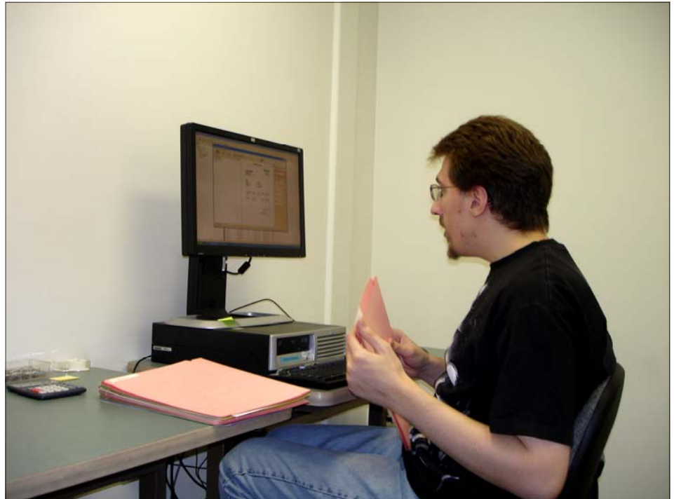
Student workers get a sense of pride in the work they do and a feeling of being valued and appreciated.

Student workers at NE Metro 916 convert thousands of documents into digital images and never seem bored; there's a sense of pride in the work they do and a feeling of being