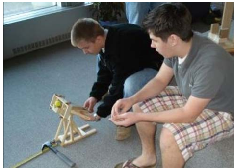
Chaska High's certified pre-engineering program, Project Lead the Way, provides students the opportunity to acquire college credit. It's one of several programs reflecting District 112's commitment to a 21 st century redesign of its program for grades 6-12.