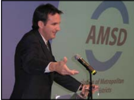
Governor Tim Pawlenty