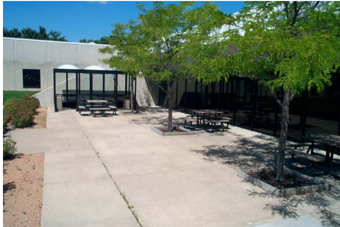
Intermediate District 287's new Bren Road Education Center offers students a welcome learning environment.

Association of Metropolitan School Districts