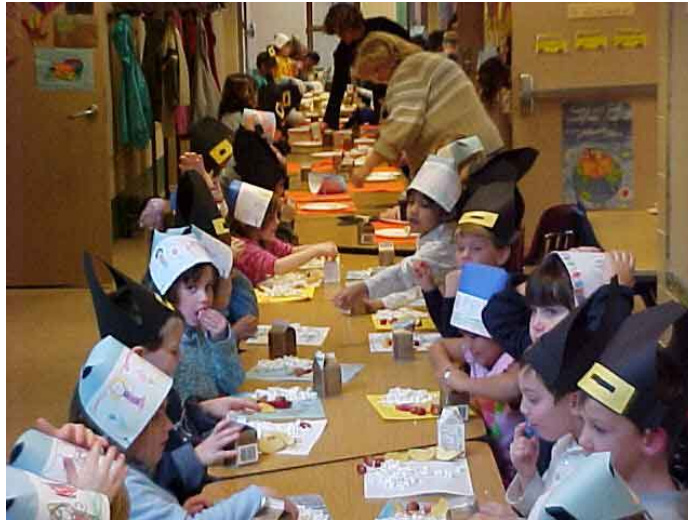
Kindergartners at Kaposia Education Center enjoy a mock Thanksgiving feast. Full-day kindergarten allows teachers to use creative learning opportunities such as the Thanksgiving feast.

See this issue of Connections for more information.